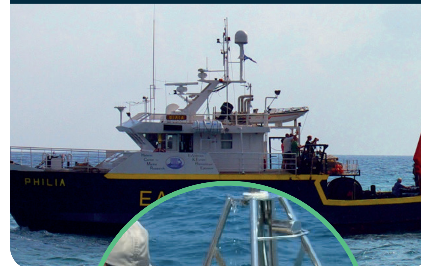
Figure: Environmental monitoring with continuous and discrete measurements

COREu will develop socioenvironmental sustainability CCS guidelines, identify sociopolitical issues and manage stakeholder consensus, and conduct baseline environmental monitoring at multiple sites and develop an associated best-practices document.