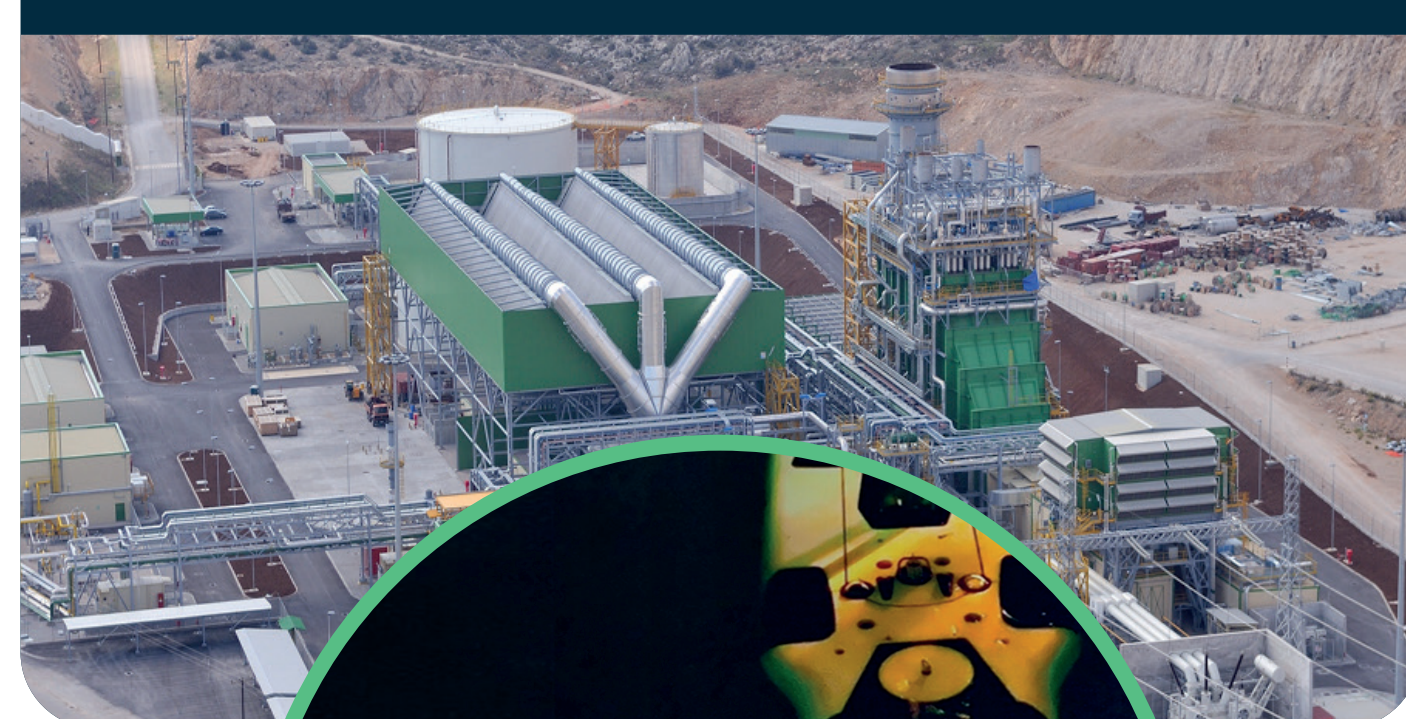
Figure: Power plant of ELPEDISON where the capture and compression will take place

COREu will demonstrate the compression of CO 2 captured from a natural gas power plant, its transportation and underground storage in Greece. The CO 2 will be captured from an advanced, 10t/d pilot plant using Rotating Packed Bed technology and will be compressed and transported in high endurance containers. CO 2 leakage detection and seismic monitoring will be performed through an advanced autonomous underwater vehicle (AUV) and wireless subsea acquisition nodes (Seanapsys). An off-shore CO 2 transfer and injection system will also be demonstrated.