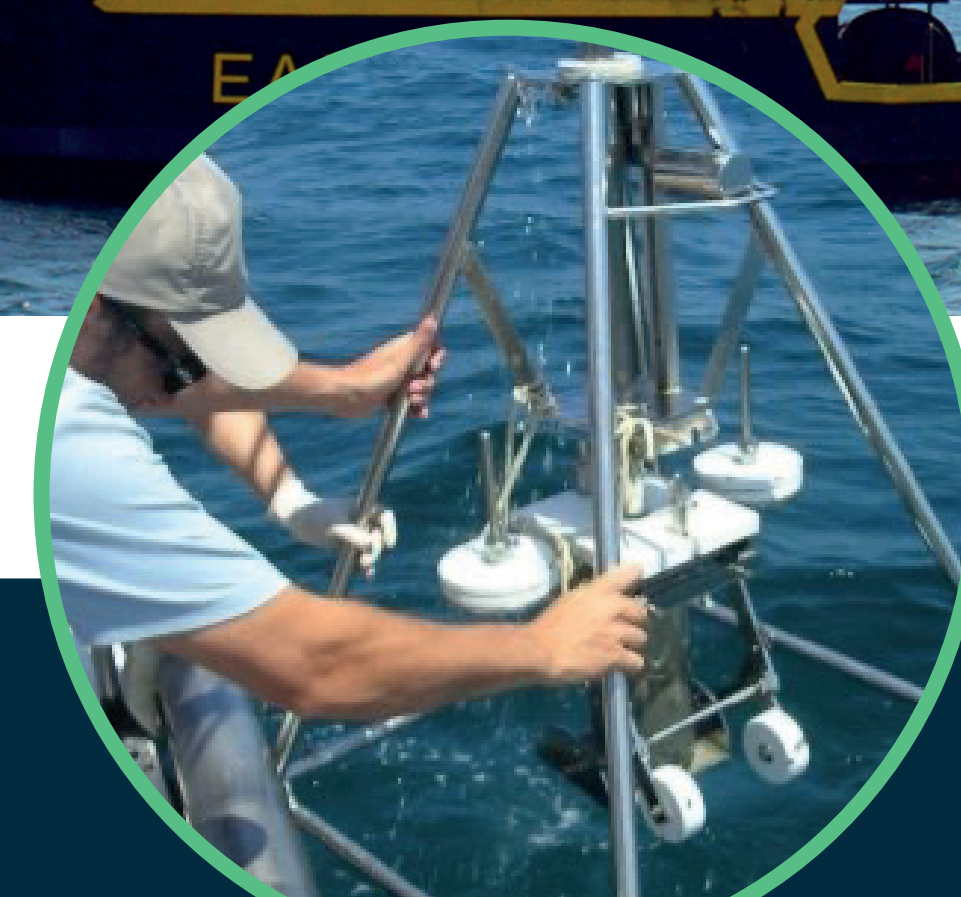
Figure: Environmental monitoring with continuous acontinuous and discrete measurements