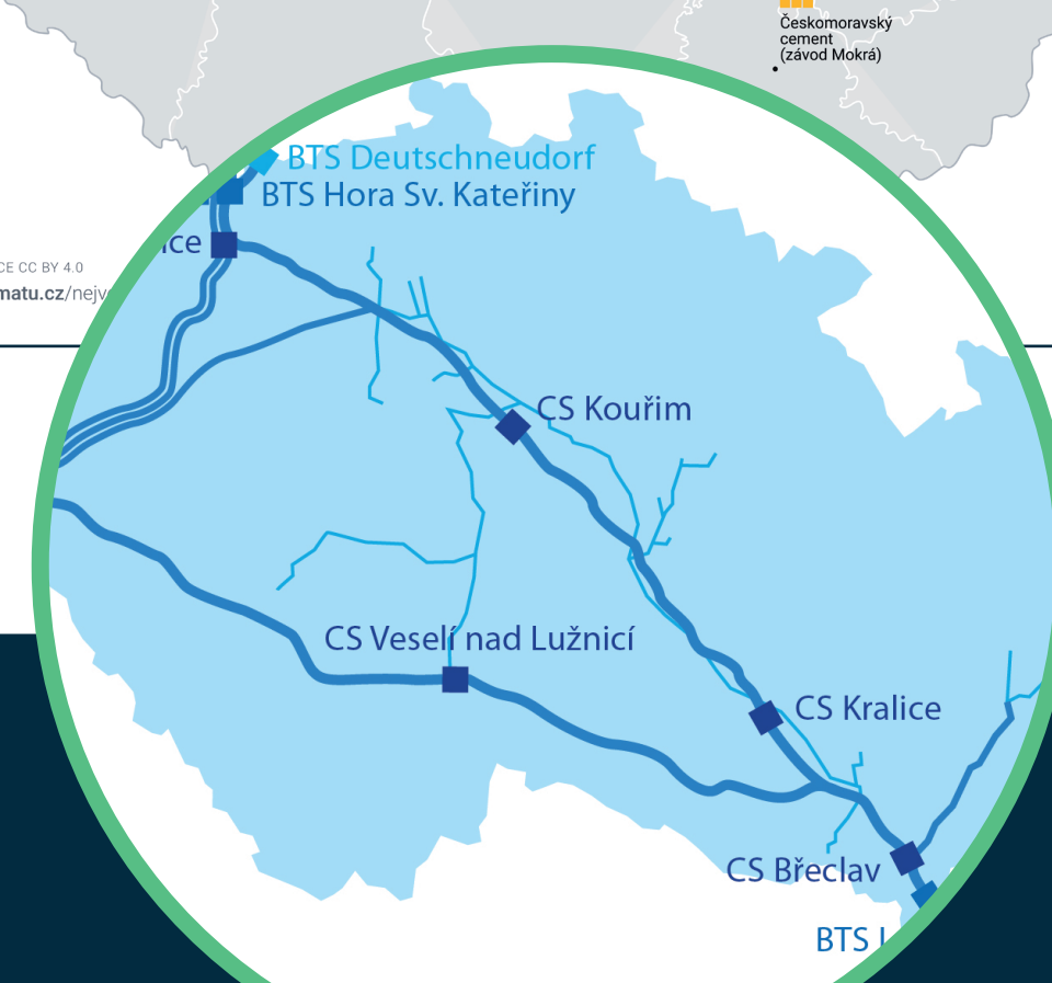
Figure: Transport pipeline system